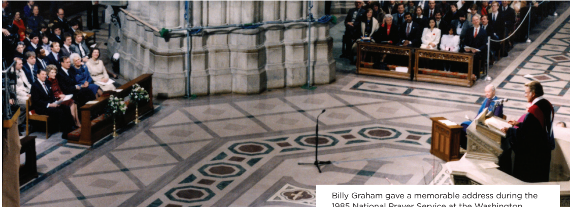
Billy Graham gave a memorable address during the 1985 National Prayer Service at the Washington Cathedral, which was attended by President Reagan, Vice President Bush, and many national leaders.