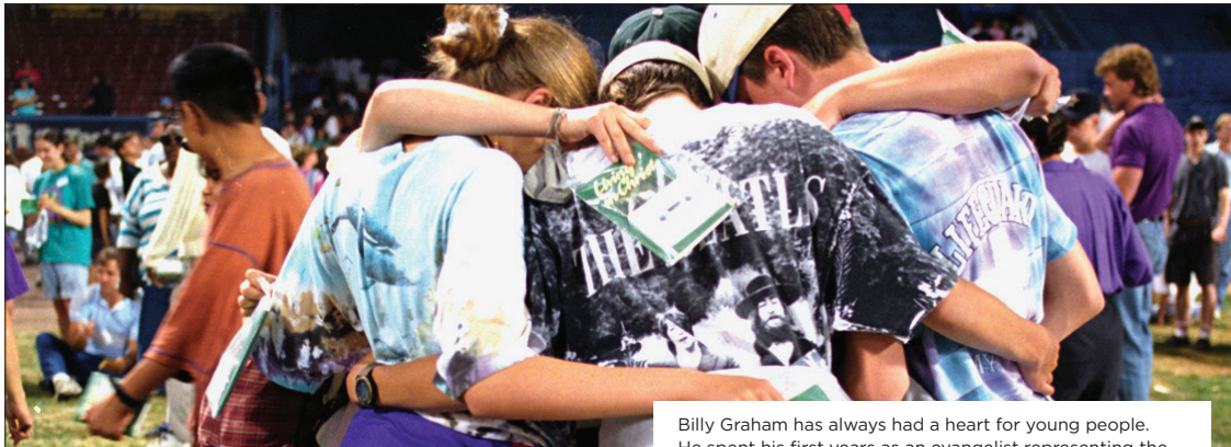
Billy Graham has always had a heart for young people. He spent his first years as an evangelist representing the organization Youth for Christ and went on to make student nights a staple in his own Crusades around the world.