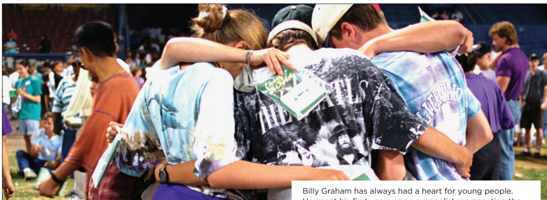
Billy Graham has always had a heart for young people. He spent his first years as an evangelist representing the organization Youth for Christ and went on to make student nights a staple in his own Crusades around the world.