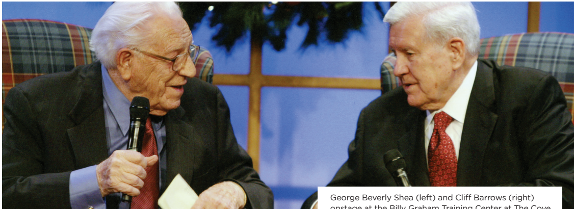
George Beverly Shea (left) and Cliff Barrows (right) onstage at the Billy Graham Training Center at The Cove.