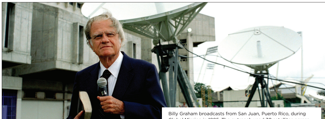
Billy Graham broadcasts from San Juan, Puerto Rico, during Global Mission in 1995. The outreach used 30 satellites across every time zone to transmit to venues in 185 countries and territories in 48 different languages.