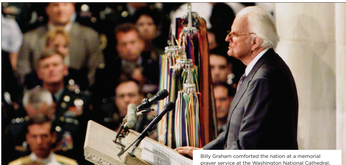
Billy Graham comforted the nation at a memorial prayer service at the Washington National Cathedral, following the 9/11 terrorist bombings.