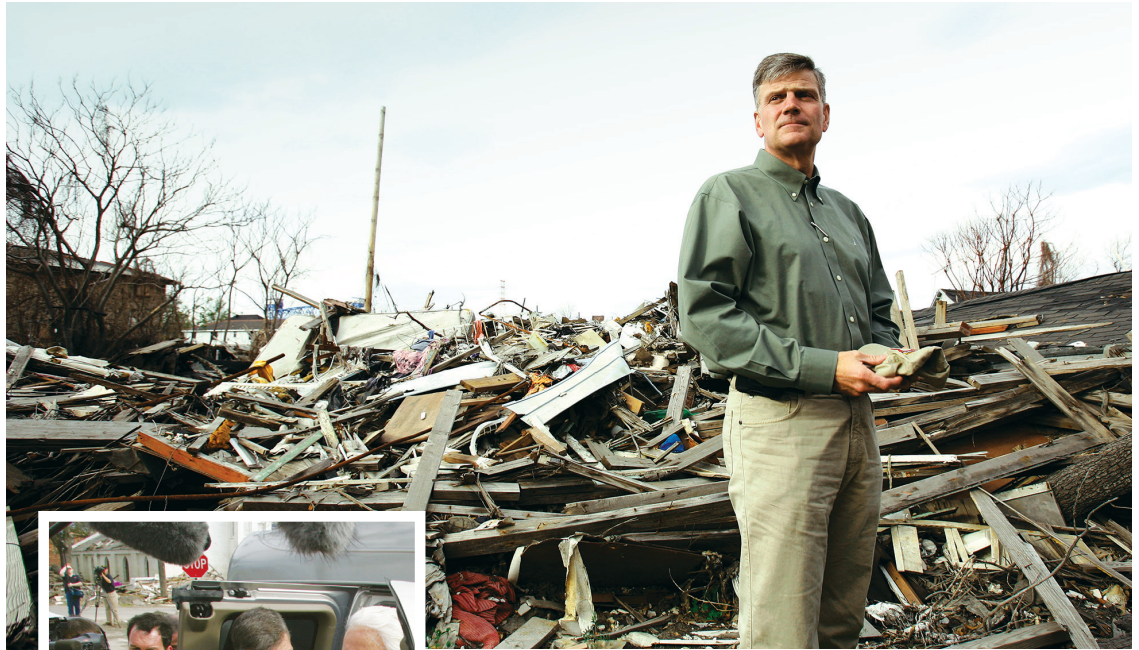
In the aftermath of Hurricane Katrina in 2005, Billy Graham and his son Franklin visited the New Orleans area to bring the hope of Jesus Christ to its community. Katrina was one of America's five deadliest hurricanes and the nation's costliest natural disaster. More than 1,450 people perished in the violent winds and floods it caused.