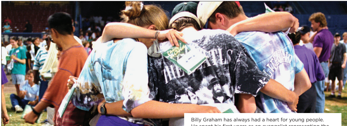
Billy Graham has always had a heart for young people. He spent his first years as an evangelist representing the organization Youth for Christ and went on to make student nights a staple in his own Crusades around the world.