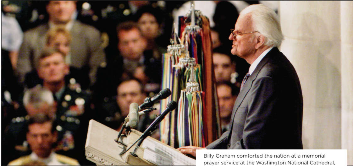
Billy Graham comforted the nation at a memorial prayer service at the Washington National Cathedral, following the 9/11 terrorist bombings.