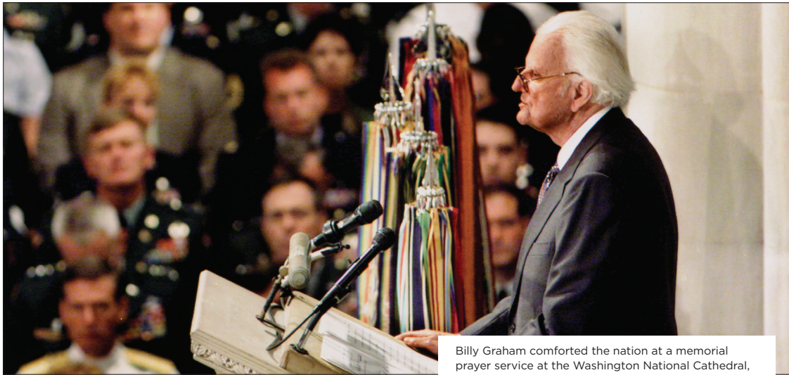
Billy Graham comforted the nation at a memorial prayer service at the Washington National Cathedral, following the 9/11 terrorist bombings.