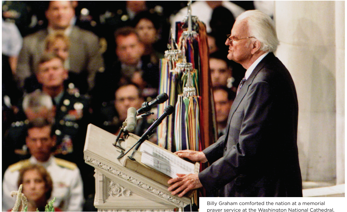
Billy Graham comforted the nation at a memorial prayer service at the Washington National Cathedral, following the 9/11 terrorist bombings.