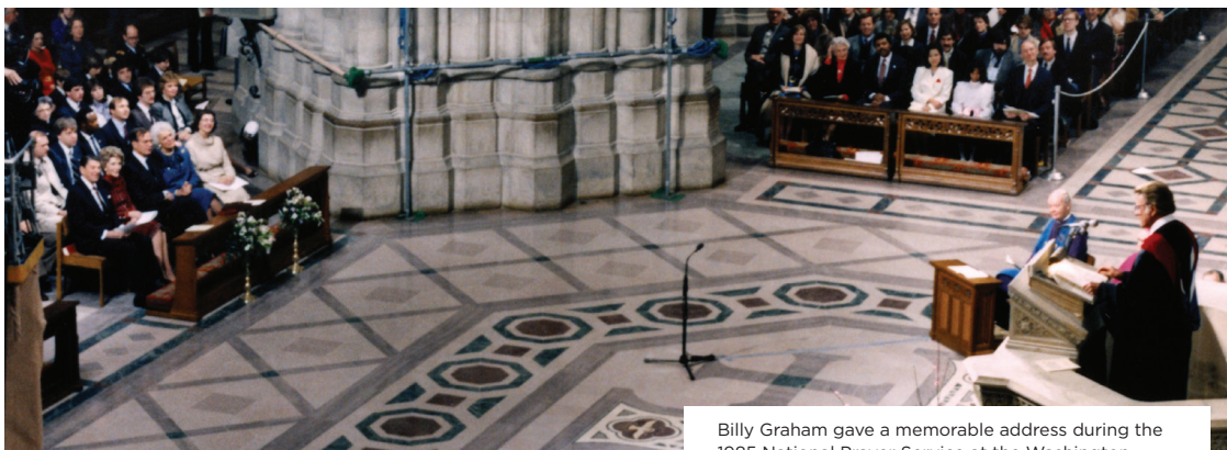
Billy Graham gave a memorable address during the 1985 National Prayer Service at the Washington Cathedral, which was attended by President Reagan, Vice President Bush, and many national leaders.